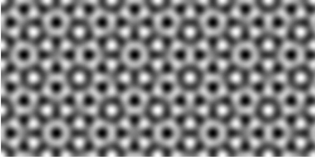
Figure 1: Example 8-fold quasipattern after [IR10]. This is an approximate solution of the steady Swift–Hohenberg equation (2) with \lambda = 0.1 , computed by using Newton iteration to find an equilibrium solution truncated to wavenumbers satisfying |\mathbf{k}| \leq \sqrt{5} and to the quasilattice \Gamma_{27} obtained with N_{\mathbf{k}} \leq 27 .

We study equation (2) for \lambda > 0 . Namely, let 2q be an even integer and let \mathbf{k}_j = \exp \frac{i\pi(j-1)}{q} , j = 1, \dots, 2q be the 2q unit vectors of the plane, identified with roots of unity. Let \Gamma be the lattice of linear combinations of vectors \mathbf{k}_j with nonnegative integer coefficients. We look for the existence of a (nonzero) \pi/q -rotation invariant solution of the form